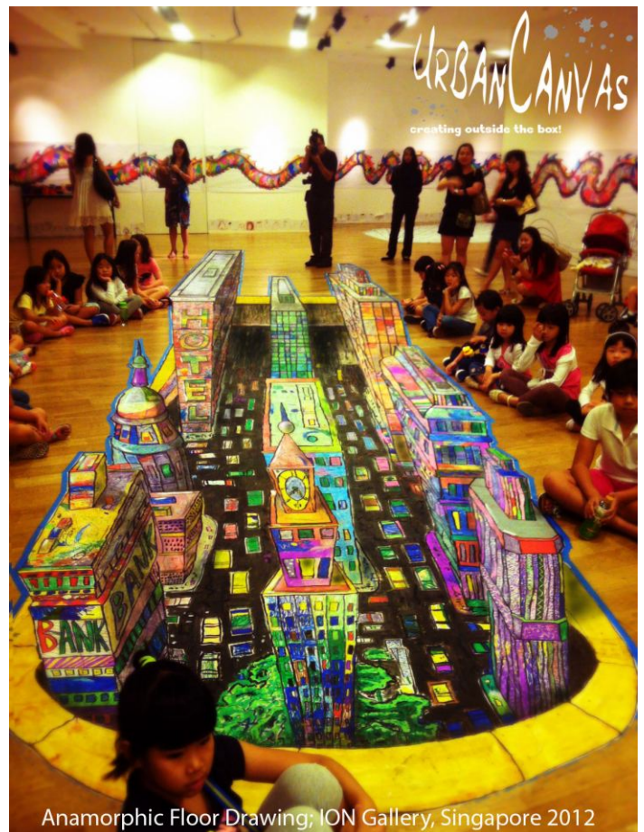
Anamorphic Floor Drawing; ION Gallery, Singapore 2012

As a result, they are now in conversation with a Singapore company about the possibility organizing the City's first ever International Street Painting Festival on Orchard Road. It's at a very early stage, but initial talks are between 40 & 50 artists taking part. If, pending funding and official permissions, this does come off, then ISPS members should expect priority status when it comes to taking part.